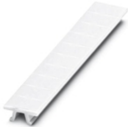
Zack marker strip, 10-section, horizontally labeled with the consecutive numbers: 21 ... 30, white, width: 6 mm

Please be informed that the data shown in this PDF Document is generated from our Online Catalog. Please find the complete data in the user's documentation. Our General Terms of Use for Downloads are valid ( http://phoenixcontact.com/download )